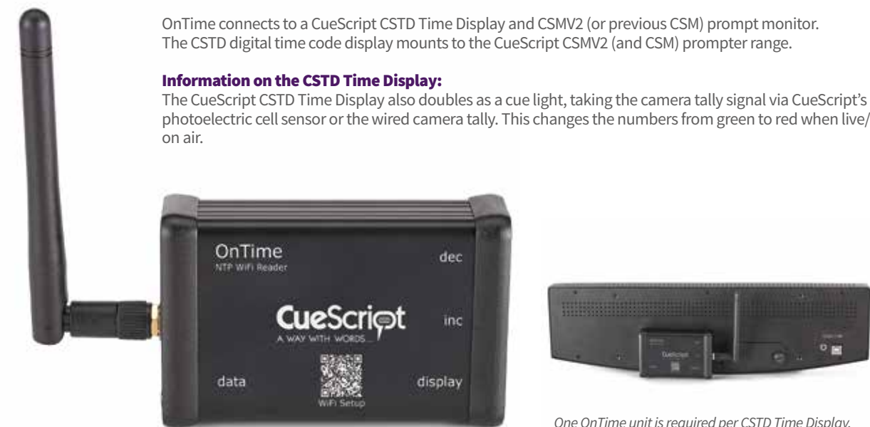
One OnTime unit is required per CSTD Time Display.

The CueScript CSTD Time Display also doubles as a cue light, taking the camera tally signal via CueScript's photoelectric cell sensor or the wired camera tally. This changes the numbers from green to red when live/on air.