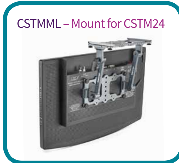
CSTMML – Mount for CSTM24