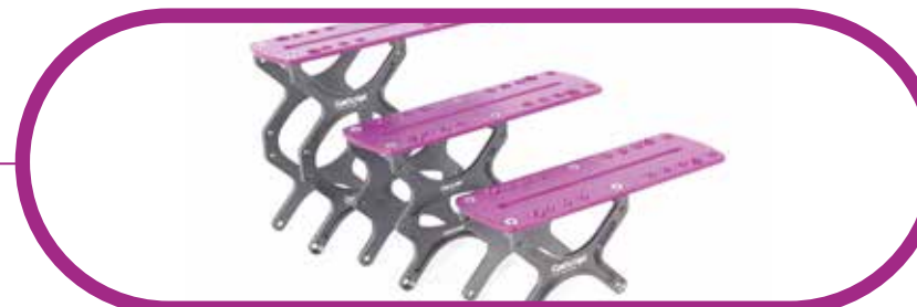
Mount Purple Riser Plates – 3 options of camera riser plate heights for CSMPL Small (3") - CSMPRS, Medium (4") - CSMPRM, Large (6") - CSMPL