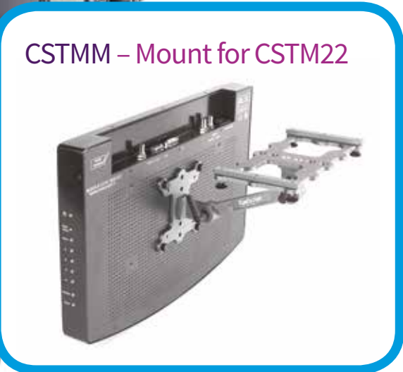
CSTMM – Mount for CSTM22