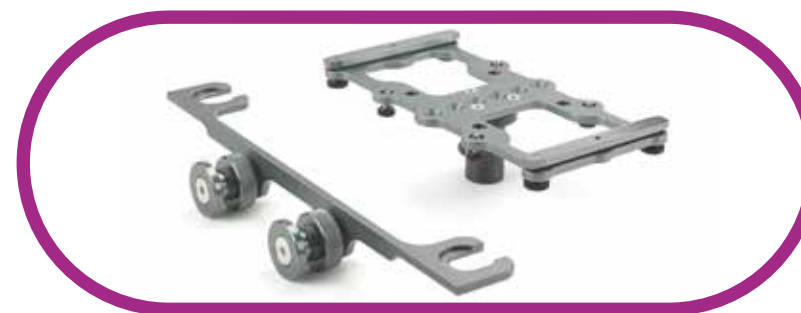
CSRAMT – Stand Mount For mounting a CSM prompter onto a stand