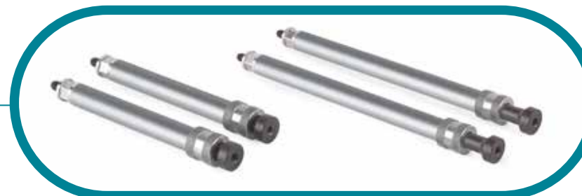
Telescopic Mounting Rods – 7"- CSTRM & 12"- CSTRL T-Rods for use with large studio heads